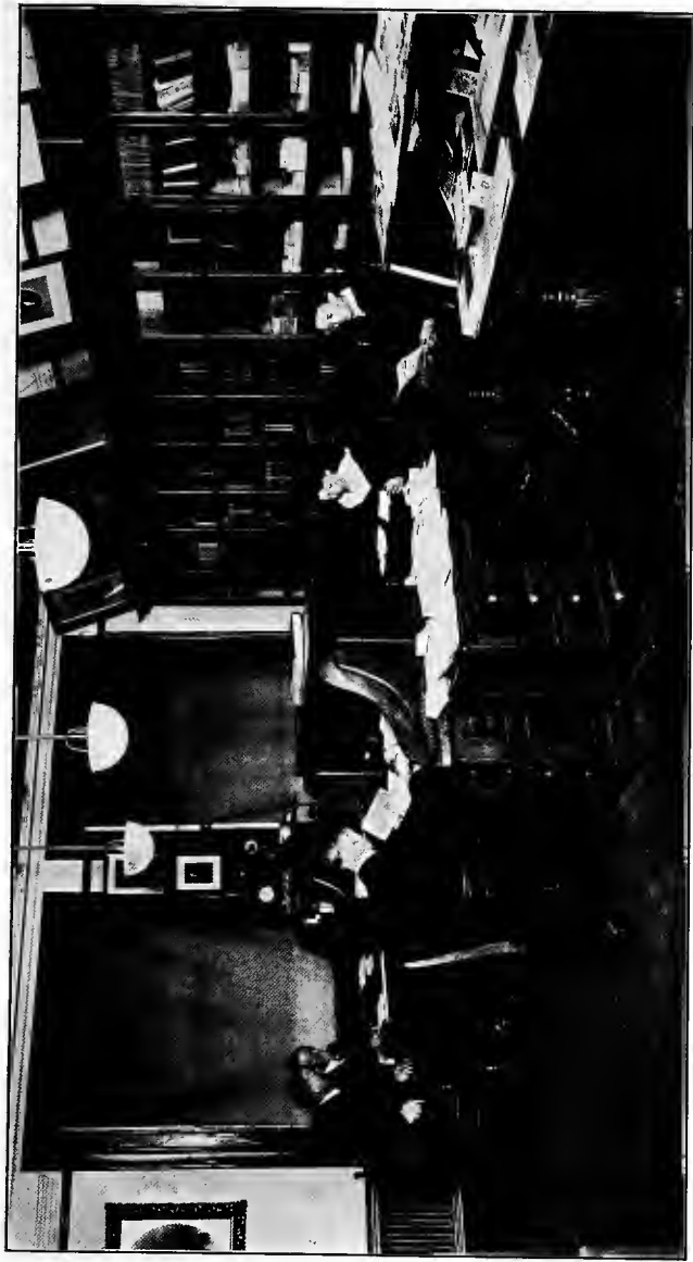
Working out temperance publications and general literature for nation-wide use